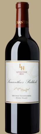
2017 Samantha's Paddock M lange Traditionnel