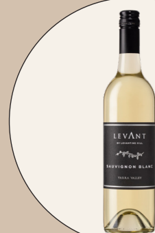
Levant Sauvignon Blanc