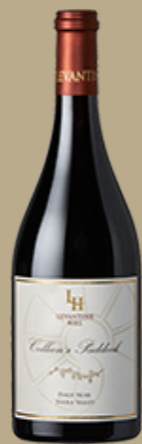
2017 Colleen's Paddock Pinot Noir