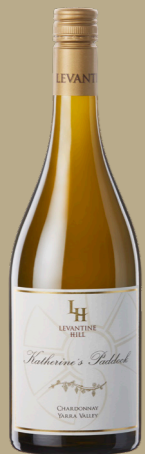
2018 Katherine's Paddock Chardonnay

One bottle, two bottles, three or six? A pack of one of our signature wines, or a mixed case? Anything is possible. Our full selection of wines is available at LEVANTINEHILL.COM.AU .