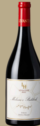
2017 Melissa's Paddock Syrah